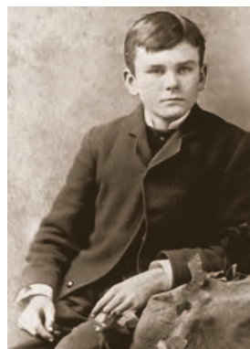
An undated photo of Michael McGivney as a young boy.