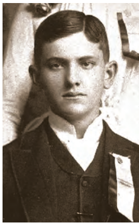
At age 16, Michael McGivney left his job in a Waterbury spoon factory to start his seminary training.

Many of the Catholics who came to the United States in the 1800s were Irish immigrants. While America offered more economic opportunity than Ireland, Catholics were still looked down upon as a lower social class. Catholics were not allowed to purchase land and were taxed by the Congregational Church — even though other religions were exempt.