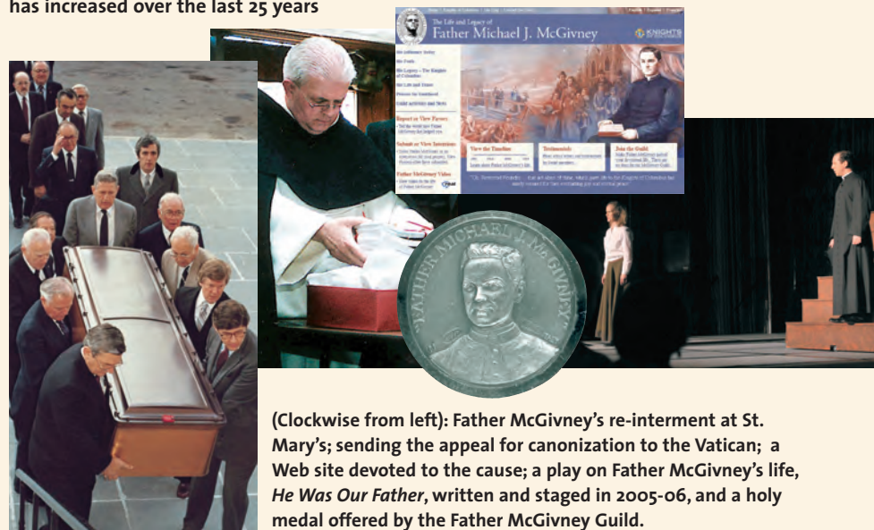
(Clockwise from left): Father McGivney's re-interment at St. Mary's; sending the appeal for canonization to the Vatican; a Web site devoted to the cause; a play on Father McGivney's life, He Was Our Father , written and staged in 2005-06, and a holy medal offered by the Father McGivney Guild.

Awareness of the life and heroic virtue of the Servant of God Father Michael J. McGivney has increased over the last 25 years