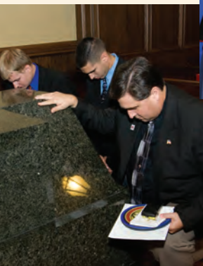
(Clockwise from above): Vatican Secretary of State Cardinal Tarcisio Bertone expresses his personal interest in the cause in August; college Knights offer prayers at Father McGivney's sarcophagus, and the best-selling biography published in 2006.